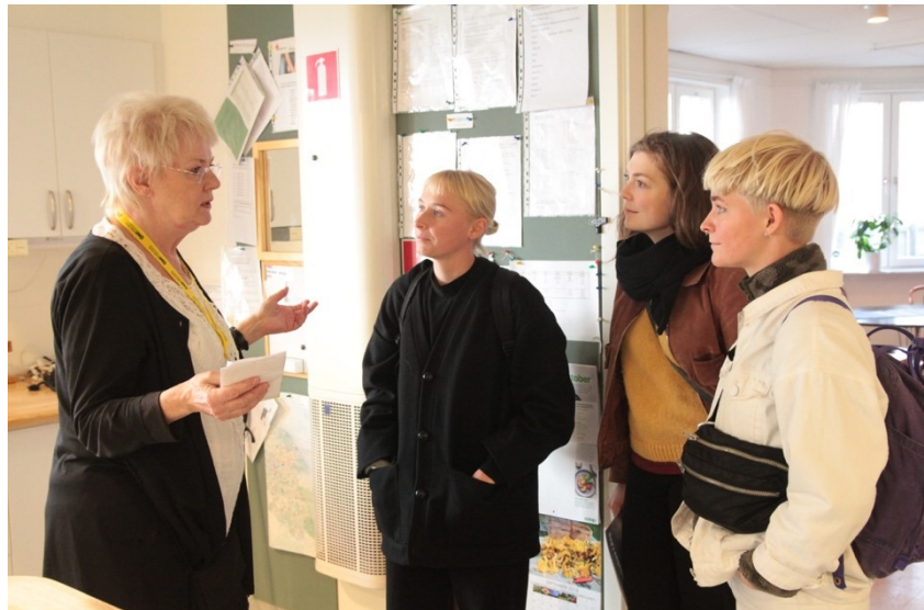
Figure 6 Open House in the collective house Färdknäppen, Stockholm 2018 with more than 140 visitors. Three students of architecture are introduced to the project.