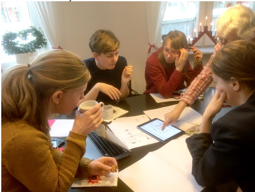
Figure 13A meeting in the cohousing starting group Kombo, Stockholm. The project is developed in cooperation with the public housing company Familjebostäder AB. To be completed 2021-2022.

What lessons can these new Swedish cohousing groups learn from history? Perhaps most important of all is that cohousing projects have showed to be sustainable over time. Good news not only for all starting groups but also for municipalities and property owners. Another important lesson from the twentieth century is that groups need to be persistent. The process is long and tiresome. A third that a lot of work always will be needed by start-up groups to form sustainable cohousing projects. But the work put in by start-up groups with physical lay-out and social infrastructure is probably a key factor to good functioning and sustainability over time.