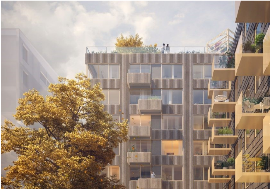
Figure 7A cohousing project in Uppsala to be finished in 2022. Cohousing association Rudbeckia in cooperation with SveaFastigheterBostad AB (Belatchew Architects).

examples of the growing interest among some private developers and property owners for cohousing.