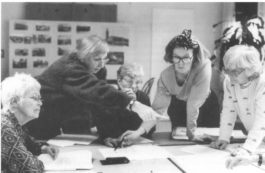
Figure 4 One of many meetings during the planning of Färdknäppen, Sweden's first senior cohousing project.

The answer is found today in the collective housing Färdknäppen, planned and projected in close cooperation between the prospective tenants, the landlord and the architect. When we moved in 1993, we were a close-knit bunch that during the planning and construction period had many occasions to talk us together around the big and small issues' (William-Olsson, 1994).