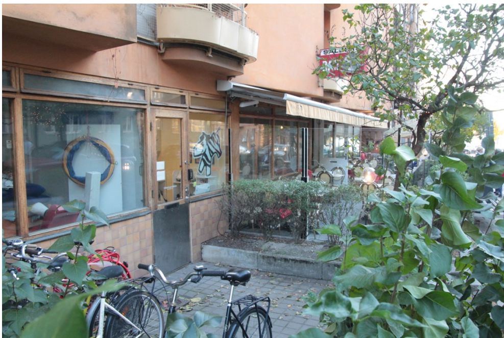
Figure 1 John Ericssonsgatan 6, the first modern collective house in Stockholm. Entrance to the day nursery, still functioning. The restaurant is to the left.

Sweden's long tradition of collective housing extends from 1905 onwards, starting with the one-kitchen housing project Hemgårdens Centralkök (The Home Yard Central Kitchen) in Stockholm. In Hemgårdens Centralkök the flats had no kitchen but were served by a central kitchen in the cellar with the help of dumbwaiters to each floor. A few more of this kind followed in the 1910s and 1920s. The first modernist collective house in Sweden was built in 1935 in Stockholm. It was designed by the architect Sven Markelius, who lived there himself for many years. These first collective housing units were based not on cooperation, but on paid services. The tenants themselves were not expected to do any house work, with their homes services by collectively employed staff, even for laundry and room cleaning (Vestbro, 1982). Around 15 collective houses of this type were built from 1935 - 1956, most by private landlords but some also by public companies.