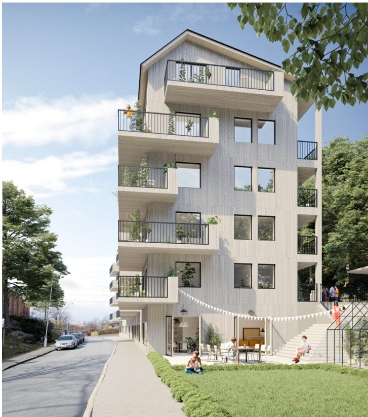
Figure 12 Bygggemenskapen/The Building Community Ärlan, Gothenburg. 29 flats and common spaces to be completed 2021. Architect and project guide InobiArkitekter. Illustration Inobi.

This project aims to develop new supporting structures and policies for building communities through collaboration between municipalities/city planning departments, end users, researchers and the private sector in order to make way for idea-driven development in a larger scale.