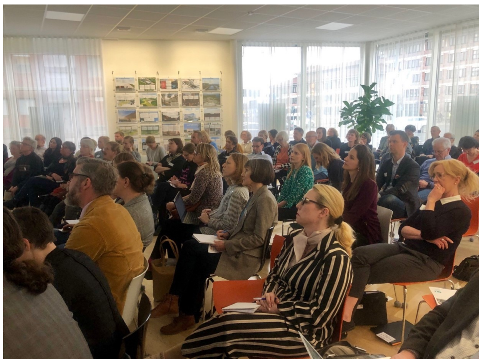
Figure 10 A conference about self-build projects in Uppsala, arranged by the city of Uppsala in cooperation with the innovation project Divercity in 2019. Uppsala forwards co-building and cohousing projects.

The municipality can facilitate building groups by land allocation and other means. Designated contact persons is another important step. The tips in the guidance on ways to facilitate building groups also benefit small scale development and cohousing starting groups (Boverket, 2018).