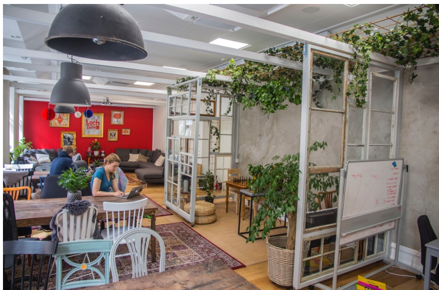
Figure 11 The common dwelling room in K9, a co-living project in Stockholm, created by Tech Farm in 2016. 50 persons from 22 nationalities live in small private rooms and share common facilities.

1. Tech Farm: Future's space-efficient housing. The purpose of the research project is to investigate whether multi-family houses can be built where the living space is 60% less while the well-being increases. The goal is a new international standard for building housing. The solution means shared areas and small sleeping modules combined with life balance and well-being programs. 10-20 people will stay in a test bed for less than 6 months, and researchers will follow these to see how the accommodation affects their perceived quality of life. The project period is Nov. 2016 – Dec. 2018.