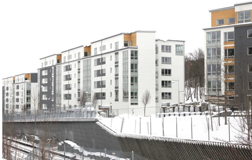
Figure 5 Dunderbacken, Stockholm, a senior cohousing project from 2010. 61 flats and common spaces. Rental, owned by the municipal housing company AB Familjebostäder.

Trosa, Gothenburg, Mölndal, Tanum, Lund and Malmö. Färdknäppen has not only become a role model for senior cohousing projects in Sweden but also in Tokyo, Finland and Germany.